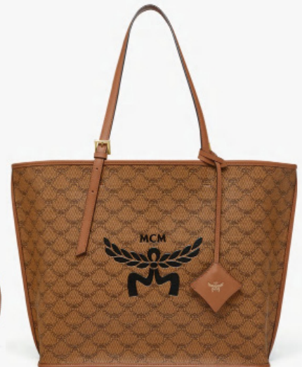
HIMMEL SHOPPER IN LAURETOS (MEDIUM) THB 24,000 / NOW THB 16,800