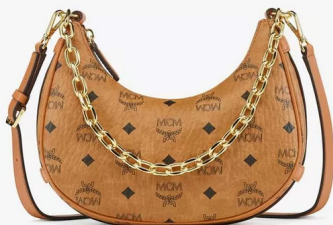
AREN CRESCENT HOBO IN VISETOS (MINI)