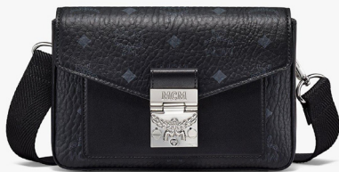
VIKTOR CROSSBODY IN VISETOS (SMALL) THB 29,100 / NOW THB 20,370