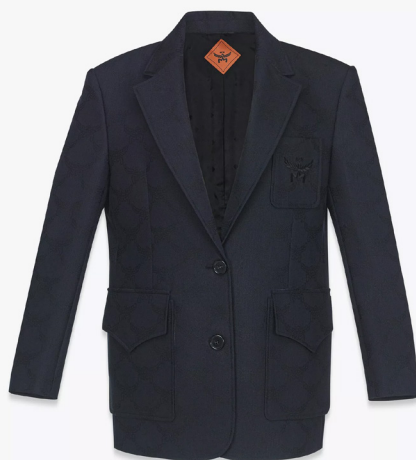
CRYSTAL MONOGRAM PONTE HOODIE SIZE : 42,44