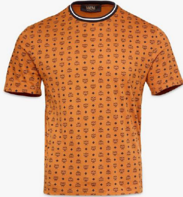
VISETOS PRINT T-SHIRT IN ORGANIC COTTON SIZE : S,M,L,XL