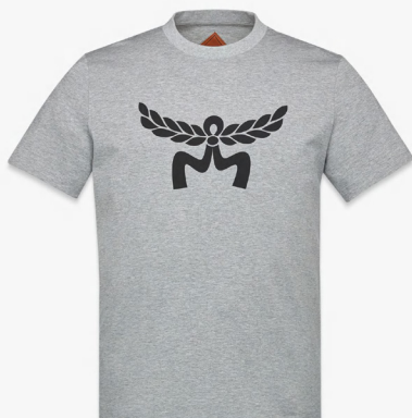
LAUREL LOGO PRINT T-SHIRT IN ORGANIC COTTON