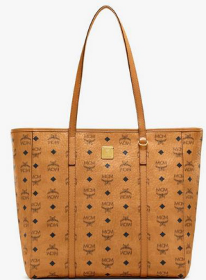
TONI TOP-ZIP SHOPPER IN VISETOS (MEDIUM)