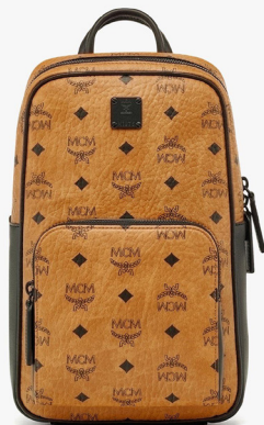
AREN SLING BAG IN VISETOS