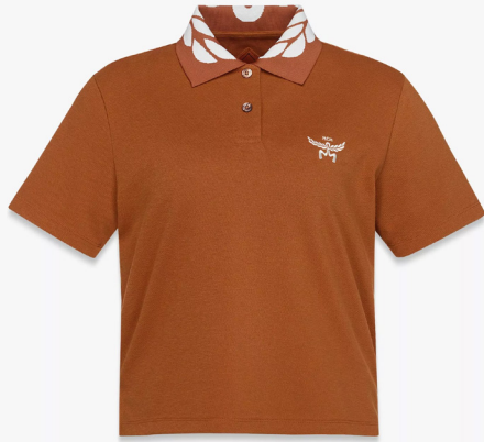
INTARSIA LAUREL PIQUÉ POLO