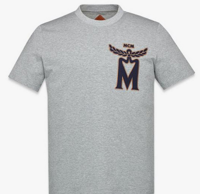
M LOGO EMBROIDERY T-SHIRT IN ORGANIC COTTON