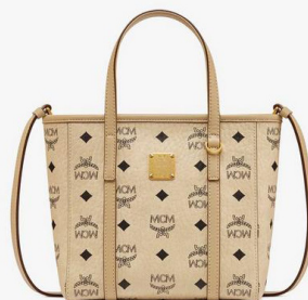
TONI TOP-ZIP SHOPPER IN VISETOS (MINI)