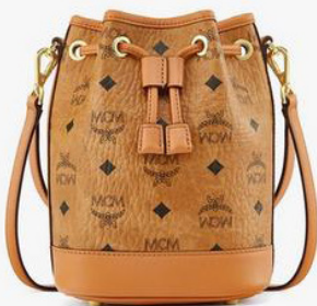
DESSAU DRAWSTRING BAG IN VISETOS (MINI) THB 29,500 / NOW THB 23,600