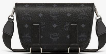
AREN MESSENGER BAG IN VISETOS (MINI)