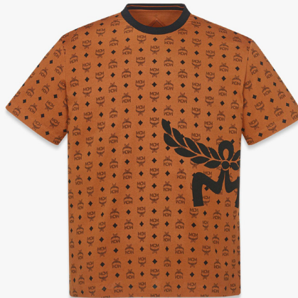
MEGA LAUREL MONOGRAM PRINT T-SHIRT IN ORGANIC COTTON SIZE : M,L,XL