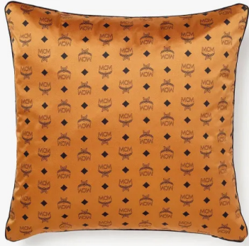
MCM MONOGRAM PILLOW