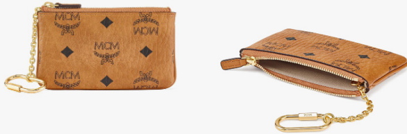
KEY POUCH IN VISETOS ORIGINAL