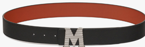
CLAUS FLUTED M REVERSIBLE BELT IN EMBOSSED LEATHER