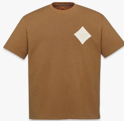
LOGO PATCH BOUCLÉ T-SHIRT IN ORGANIC COTTON