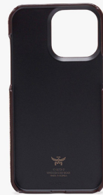
IPHONE 15 PRO MAX CASE IN MAXI VISETOS