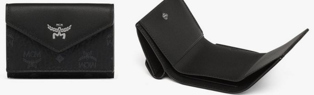
AREN TRIFOLD WALLET IN VISETOS