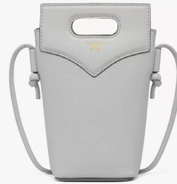
DIAMOND CROSSBODY POUCH IN EMBOSSSED LEATHER AND CALFSKIN