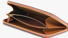
LARGE ZIP WALLET