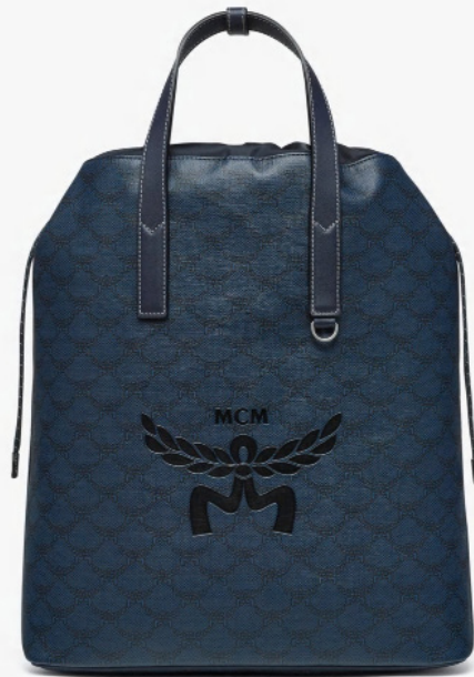
HIMMEL DRAWSTRING BACKPACK IN LAURETOS