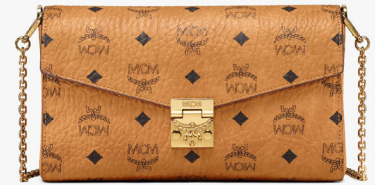
TRACY CROSSBODY IN VISETOS (MEDIUM) THB 22,900 / NOW THB 18,320