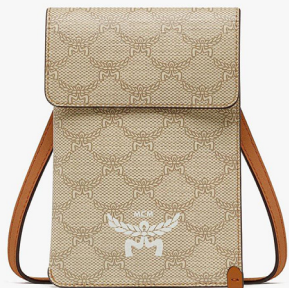
HIMMEL LANYARD IN LAURETOS THB 13,700 / NOW THB 9,590