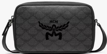
HIMMEL CROSSBODY N LAURETOS (SMALL) THB 22,000 / NOW THB 17,600