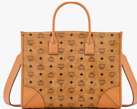
MÜNCHEN TOTE IN VISETOS (LARGE)