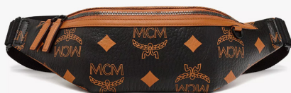
FURSTEN BELT BAG IN MONOGRAM MIX (MEDIUM) THB 24,100 / NOW THB 16,870