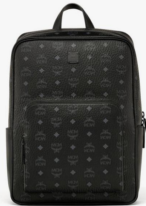
AREN SLING BAG IN VISETOS