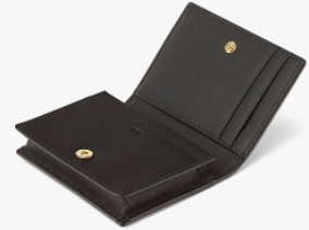
TRACY CARD HOLDER IN VISETOS