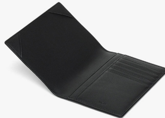
OTTOMAR PASSPORT HOLDER IN VISETOS