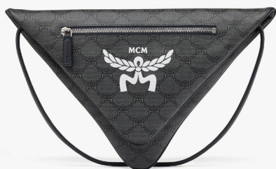
HIMMEL TRIANGLE POUCH IN LAURETOS