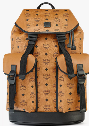
BRANDENBURG BACKPACK IN VISETOS