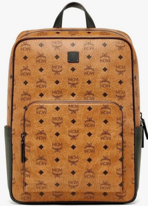
AREN SLING BAG IN VISETOS