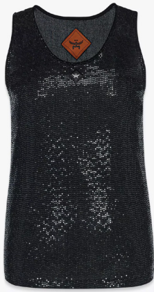
SEQUIN TANK TOP SIZE : S,M,L