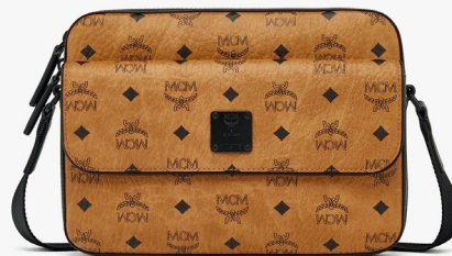
AREN MESSENGER BAG IN VISETOS (MEDIUM)