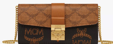
TRACY CHAIN WALLET IN MONOGRAM MIX (LARGE)