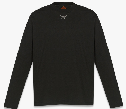
ESSENTIAL LAUREL LOGO SHIRT IN ORGANIC COTTON