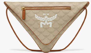
HIMMEL TRIANGLE POUCH IN LAURETOS