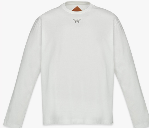
ESSENTIAL LAUREL LOGO SHIRT IN ORGANIC COTTON