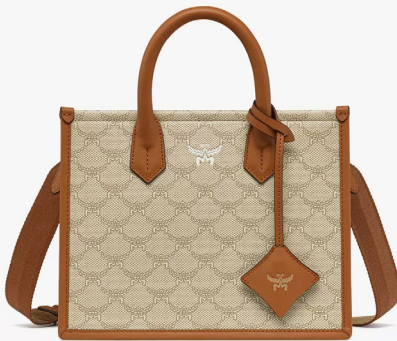
HIMMEL TOTE IN LAURETOS (SMALL)