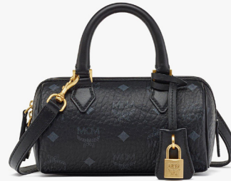
ELLA BOSTON BAG IN VISETOS (MINI) THB 28,900 / NOW THB 23,120