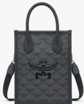
HIMMEL TOTE IN LAURETOS