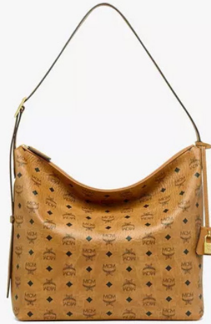
AREN HOBO IN VISETOS (LARGE) THB 33,500 / NOW THB 26,800