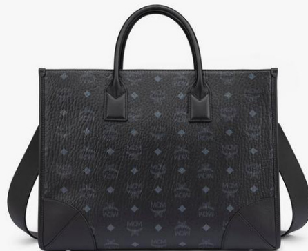
MÜNCHEN TOTE IN VISETOS (LARGE)