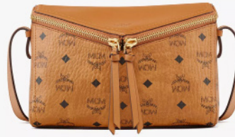
DIAMANT 3D SHOULDER BAG IN VISETOS LEATHER MIX (SMALL)