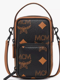
AREN CROSSBODY PHONE CASE IN MONOGRAM MIX (SMALL) THB 24,200 / NOW THB 16,940