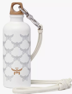
MCM X SIGG TRAVELLER BOTTLE WITH LEATHER STRAP