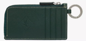
HIMMEL LANYARD ZIP CARD CASE IN LAURETOS