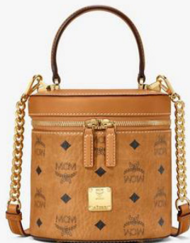
CYLINDER CROSSBODY IN VISETOS