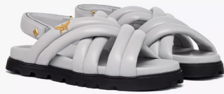
CROSS SANDALS IN LAMB LEATHER SIZE 36,37,38 THB 22,200 / NOW THB 13,320