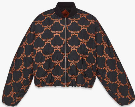
LAURETOS BOMBER JACKET IN ECONYL® SIZE : S,M,L THB 39,000 / NOW THB 23,400