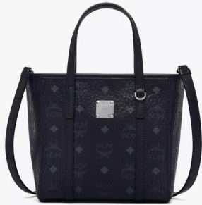
TONI TOP-ZIP SHOPPER IN VISETOS (MINI) THB 23,000 / NOW THB 16,100