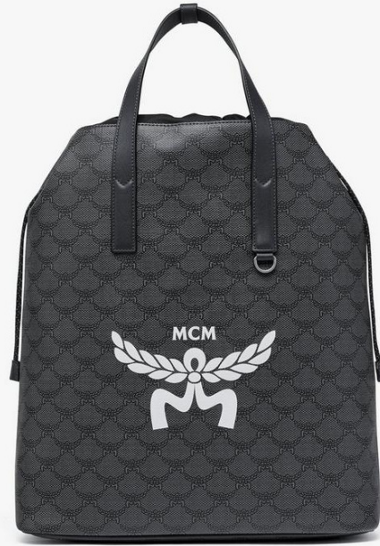
HIMMEL DRAWSTRING BACKPACK IN LAURETOS