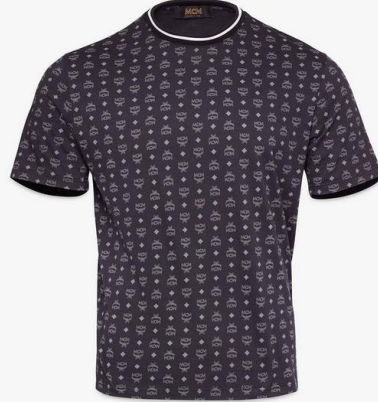
VISETOS PRINT T-SHIRT IN ORGANIC COTTON SIZE : M,L