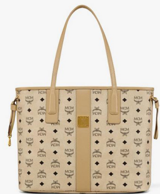
REVERSIBLE LIZ SHOPPER IN VISETOS (MEDIUM)