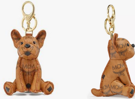
M PUP CHARM IN VISETOS