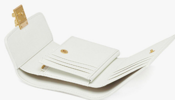
TRACY TRIFOLD WALLET IN VISETOS