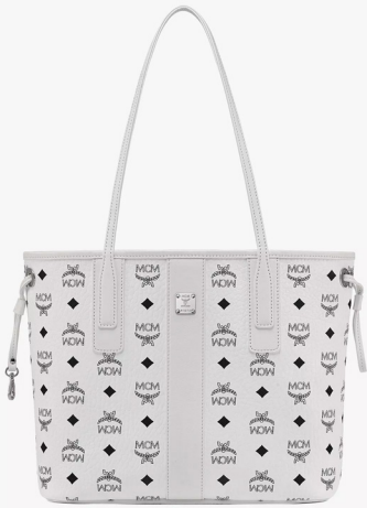
REVERSIBLE LIZ SHOPPER IN VISETOS (SMALL) THB 24,300 / NOW THB 19,440