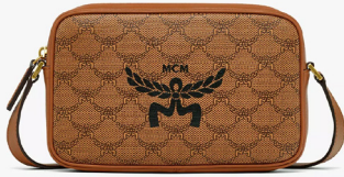
HIMMEL CROSSBODY IN LAURETOS (SMALL) THB 22,000 / NOW THB 15,400