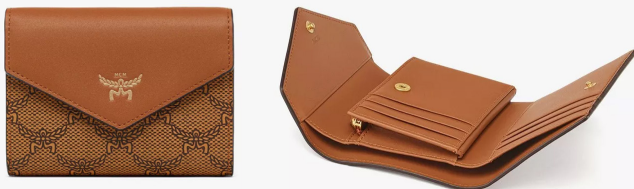
HIMMEL TRIFOLD WALLET IN LAURETOS