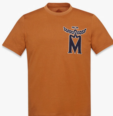
M LOGO EMBROIDERY T-SHIRT IN ORGANIC COTTON