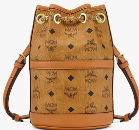
AREN CHAIN BACKPACK IN VISETOS