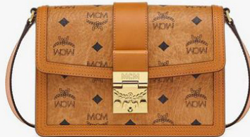
TRACY SHOULDER BAG IN VISETOS (SMALL)