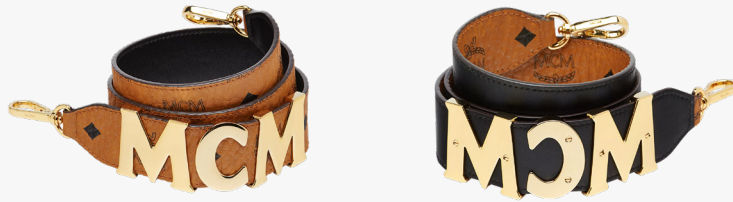
TRACY SHOULDER STRAP IN VISETOS