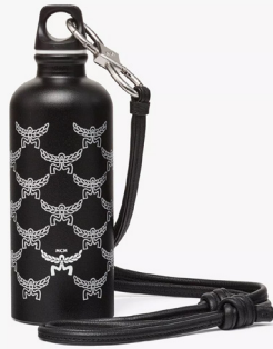
MCM X SIGG TRAVELLER BOTTLE WITH LEATHER STRAP