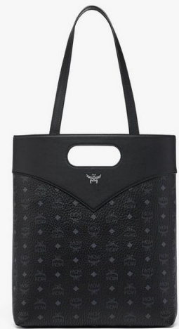
DIAMOND TOTE IN VISETOS LEATHER MIX THB 35,500 / NOW THB 28,400