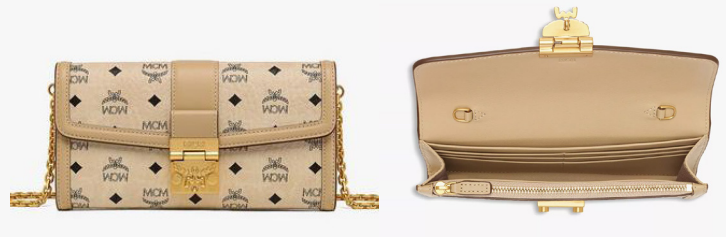
HIMMEL TRIFOLD WALLET IN LAURETOS