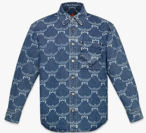
LAURETOS MONOGRAM DENIM SHIRT SIZE : 48,50,52 THB 17,600 / NOW THB 10,560