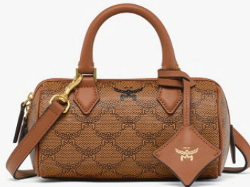
ELLA BOSTON BAG IN LAURETOS (MINI) THB 23,700 / NOW THB 16,590