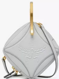
DIAMOND LOGO CROSSBODY IN CALF LEATHER