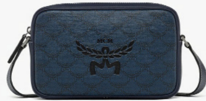
HIMMEL CROSSBODY IN LAURETOS