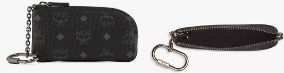
AREN KEY POUCH IN VISETOS