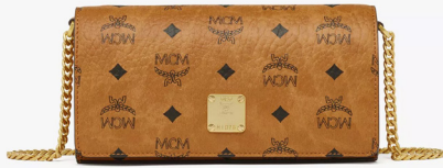
AREN SHOULDER BAG IN VISETOS