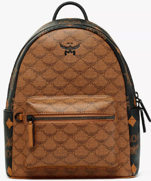
STARK BACKPACK IN MONOGRAM MIX (SMALL) THB 38,400 / NOW THB 26,880