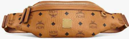
FURSTEN BELT BAG IN VISETOS (SMALL) THB 20,500 / NOW THB 16,400