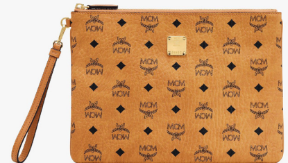
WRISTLET ZIP POUCH IN VISETOS ORIGINAL IN VISETOS THB 15,700 / NOW THB 12,560