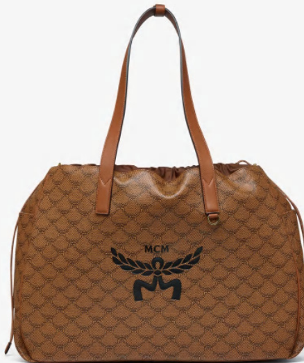
HIMMEL DRAWSTRING TOTE IN LAURETOS (X-LARDE) THB 35,500 / NOW THB 24,850