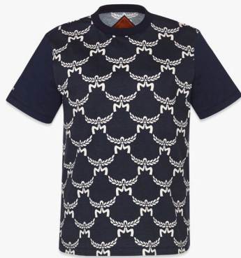
LAURETOS MONOGRAM T-SHIRT IN ORGANIC COTTON SIZE : XS,S,M,L,XL THB 11,500 / NOW THB 6,900