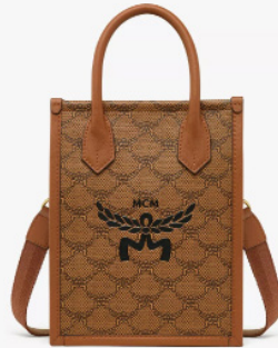
HIMMEL TOTE IN LAURETOS THB 22,400 / NOW THB 15,680