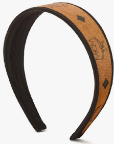
HEADBAND IN VISETOS