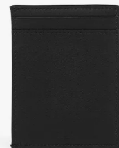
HIMMEL CARD CASE IN LAUREL CALF LEATHER