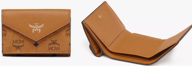
AREN TRIFOLD WALLET IN VISETOS