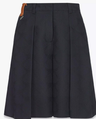
LAURETOS WOOL JACQUARD SHORTS SIZE : 40,42