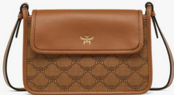
HIMMEL CROSSBODY IN LAURETOS (SMALL) THB 24,500 / NOW THB 17,150