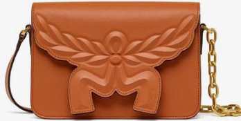
HIMMEL LAUREL CROSSBODY IN CALF LEATHER