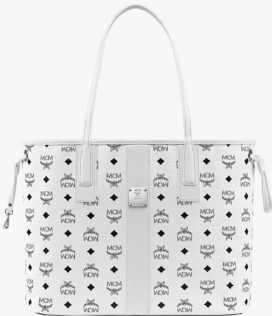
REVERSIBLE LIZ SHOPPER IN VISETOS (MEDIUM) THB 26,600 / NOW THB 21,280