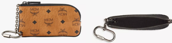
AREN KEY POUCH IN VISETOS