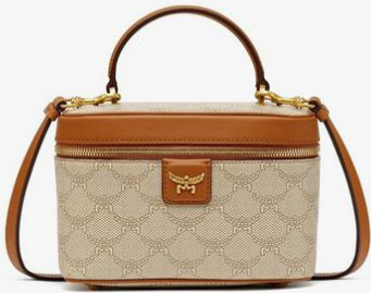
HIMMEL VANITY CASE IN LAURETOS