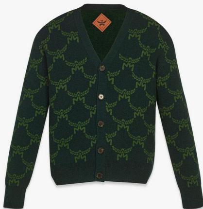
LAURETOS CARDIGAN IN WOOL AND RECYCLED CASHMERE SIZE : S,M,L THB 24,500 / NOW THB 14,700