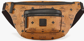
FURSTEN BELT BAG IN VISETOS (MINI)