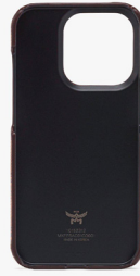
IPHONE 15 PRO CASE IN LAURETOS