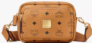
AREN CROSSBODY IN VISETOS (X-MINI) THB 24,200 / NOW THB 19,360