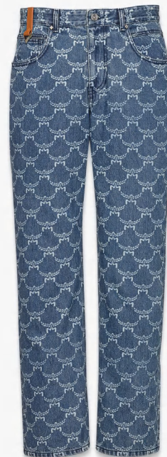
LAURETOS MONOGRAM PANTS IN ECONYL® SIZE : S,M,L THB 25,600 / NOW THB 15,360