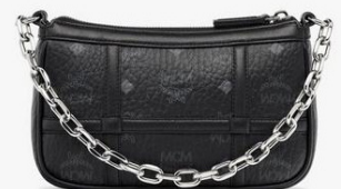
TRACY CROSSBODY IN VISETOS (MINI)