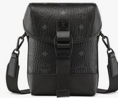
AREN N/S CROSSBODY IN VISETOS