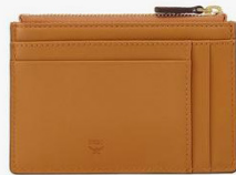
AREN ZIP CARD CASE