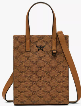
AREN TOTE IN MONOGRAM MIX (MINI) THB 25,900 / NOW THB 18,130