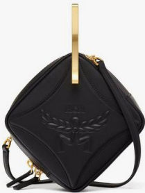
DIAMOND LOGO CROSSBODY IN CALF LEATHER