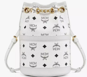
AREN CHAIN BACKPACK IN VISETOS