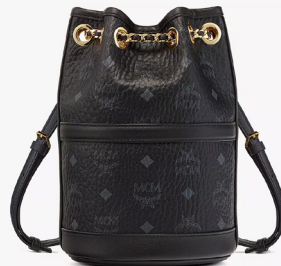
AREN CHAIN BACKPACK IN VISETOS