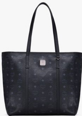
TONI TOP-ZIP SHOPPER IN VISETOS (MEDIUM)