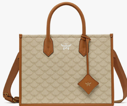
HIMMEL TOTE IN LAURETOS (MEDIUM)