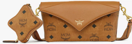
DIAMOND CROSSBODY W/ AIRPODS PRO CHARM IN VISETOS