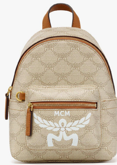
STARK BEBE BOO BACKPACK IN LAURETOS