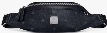
FURSTEN BELT BAG IN VISETOS (SMALL) THB 20,500 / NOW THB 16,400