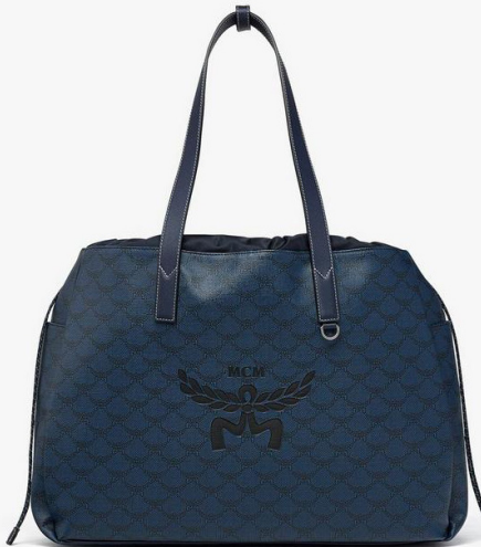
HIMMEL DRAWSTRING TOTE IN LAURETOS (X-LARDE) THB 35,500 / NOW THB 28,400