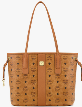
REVERSIBLE LIZ SHOPPER IN VISETOS (SMALL)