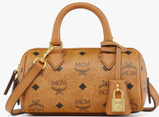
ELLA BOSTON BAG IN VISETOS (MINI) THB 28,900 / NOW THB 23,120