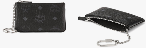
KEY POUCH IN VISETOS ORIGINAL