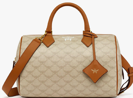
ELLA BOSTON BAG IN LAURETOS (MEDIUM)