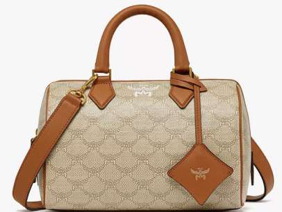
ELLA BOSTON BAG IN LAURETOS (SMALL)