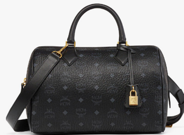
ELLA BOSTON BAG IN VISETOS (SMALL) THB 29,600 / NOW THB 23,680