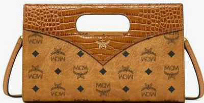
DIAMOND TOTE IN EMBOSSED LEATHER (MINI) THB 30,800 / NOW THB 24,640