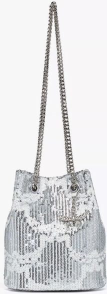
HIMMEL BUCKET BAG IN SEQUIN MONOGRAM LEATHER