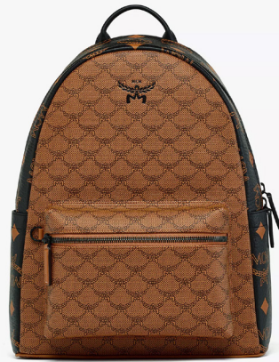
STARK BACKPACK IN MONOGRAM MIX (MEDIUM) THB 44,400 / NOW THB 31,080