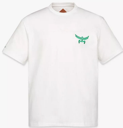
MCM X HONEY DIJON T-SHIRT IN ORGANIC COTTON