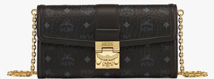
TRACY CHAIN WALLET IN VISETOS