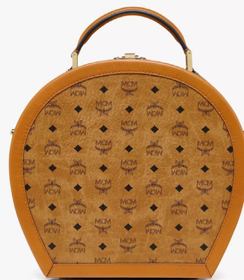
HAT BOX IN VISETOS (MEDIUM)