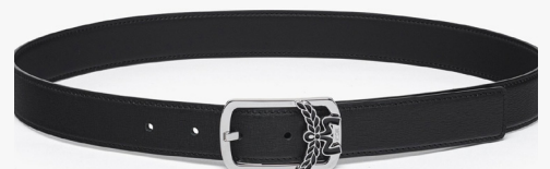
AREN EPOXY LAUREL BELT IN EMBOSSED LEATHER