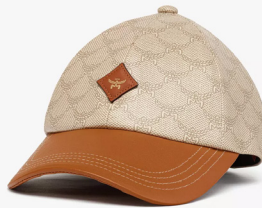
MONOGRAM CAP IN LAURETOS AND LEATHER