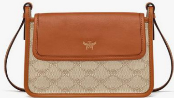
HIMMEL CROSSBODY IN LAURETOS (SMALL) THB 24,500 / NOW THB 17,150