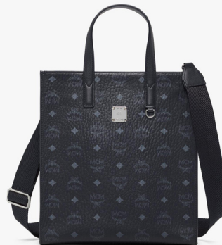
AREN TOTE IN VISETOS (SMALL)