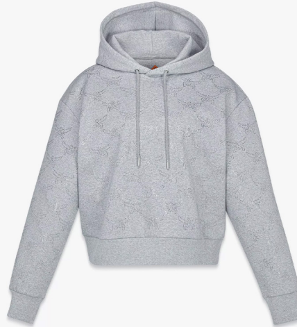
CRYSTAL MONOGRAM PONTE HOODIE SIZE : S,M THB 25,600 / NOW THB 15,360