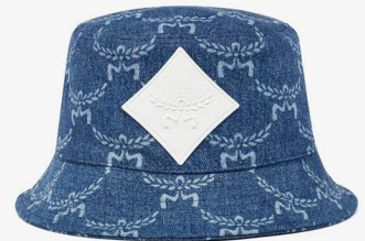
LAURETOS DENIM BUCKET HAT BLUE