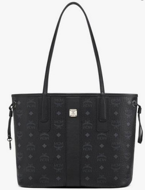
REVERSIBLE LIZ SHOPPER IN VISETOS (SMALL)