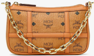
AREN SHOULDER BAG IN VISETOS (MINI) THB 22,900 / NOW THB 18,320