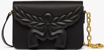
HIMMEL LAUREL CROSSBODY IN CALF LEATHER