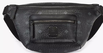
FURSTEN BELT BAG IN VISETOS (MINI) THB 19,870 / NOW THB 15,896