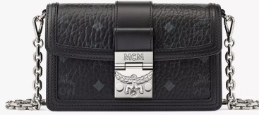
TRACY CROSSBODY IN VISETOS (MINI)