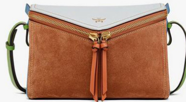
DIAMANT 3D SHOULDER BAG IN SUEDE AND CALF LEATHER (SMALL) THB 50,100 / NOW THB 35,070