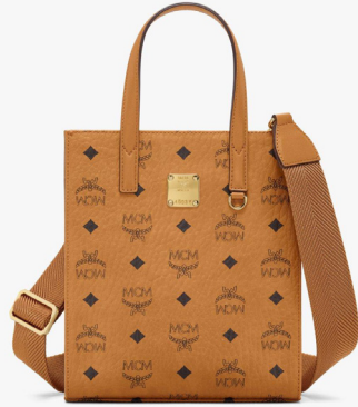
AREN TOTE IN VISETOS (MINI)