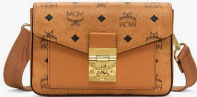
VIKTOR CROSSBODY IN VISETOS (SMALL)