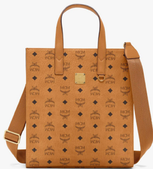
AREN TOTE IN VISETOS (SMALL)