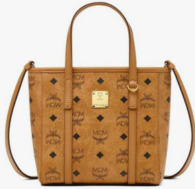
TONI TOP-ZIP SHOPPER IN VISETOS (MINI) THB 23,000 / NOW THB 16,100