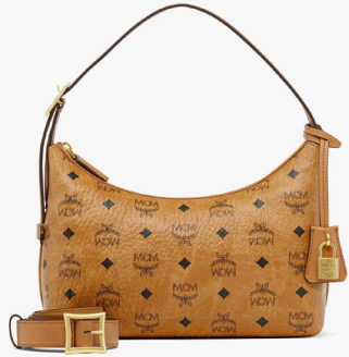
AREN HOBO IN VISETOS (SMALL) THB 29,700 / NOW THB 23,760