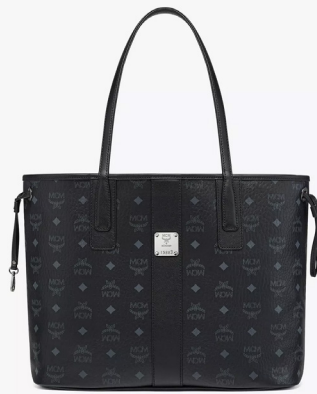
REVERSIBLE LIZ SHOPPER IN VISETOS