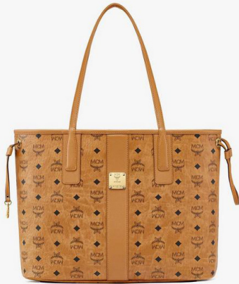
REVERSIBLE LIZ SHOPPER IN VISETOS (MEDIUM)