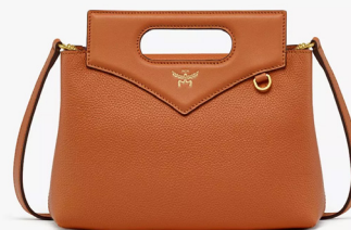
SOFT DIAMOND TOTE IN EMBOSSSED LEATHER THB 50,100 / NOW THB 35,070