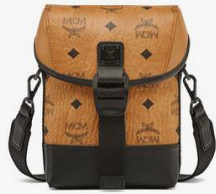
AREN N/S CROSSBODY IN VISETOS