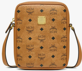
KLASSIK CROSSBODY IN VISETOS