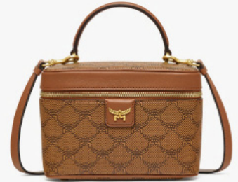
HIMMEL VANITY CASE IN LAURETOS THB 22,500 / NOW THB 15,750