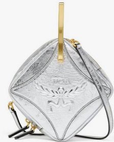
DIAMOND LOGO CROSSBODY IN CALF LEATHER