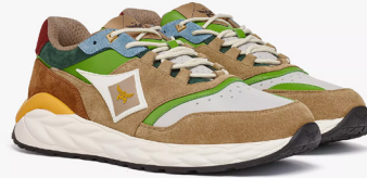
SKYWANDER LO SNEAKERS IN CALF SUEDE LEATHER SIZE 41,42,43 THB 22,300 / NOW THB 13,380