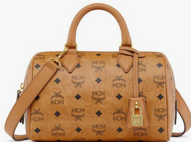
ELLA BOSTON BAG IN VISETOS (SMALL) THB 29,600 / NOW THB 23,680