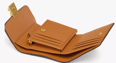
TRACY TRIFOLD WALLET IN MONOGRAM MIX