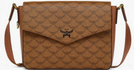
HIMMEL MESSENGER BAG IN LAURETOS (SMALL) THB 26,100 / NOW THB 18,270