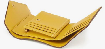
HIMMEL TRIFOLD WALLET IN LAURETOS