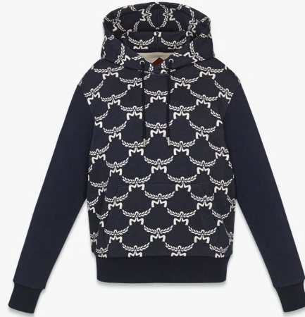
LARGE LAURETOS MONOGRAM HOODIE IN ORGANIC COTTON SIZE : S,M,L THB 17,100 / NOW THB 10,260