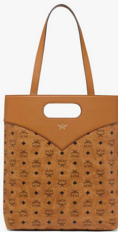
DIAMOND TOTE IN VISETOS LEATHER MIX THB 35,500 / NOW THB 28,400