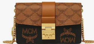
TRACY CROSSBODY IN MONOGRAM MIX (MINI) THB 22,900 / NOW THB 16,030