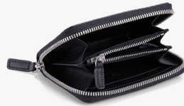
MINI ZIP WALLET