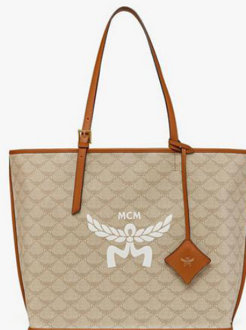
HIMMEL SHOPPER IN LAURETOS (MEDIUM)