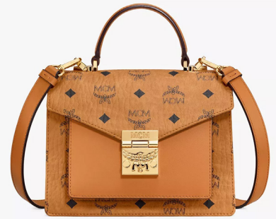
TRACY SATCHEL IN VISETOS (SMALL)