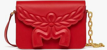
HIMMEL LAUREL CROSSBODY IN CALF LEATHER