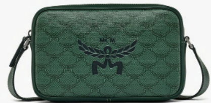
HIMMEL CROSSBODY IN LAURETOS