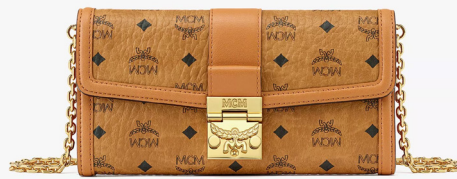
TRACY CHAIN WALLET IN VISETOS THB 20,700 / NOW THB 16,560