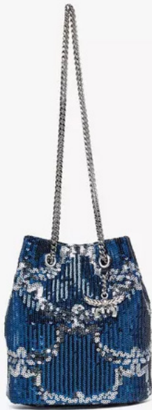
HIMMEL BUCKET BAG IN SEQUIN MONOGRAM LEATHER