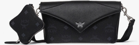
DIAMOND CROSSBODY W/ AIRPODS PRO CHARM IN VISETOS