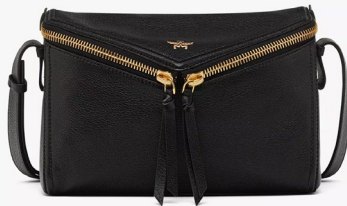
SOFT DIAMOND TOTE IN EMBOSSSED LEATHER (SMALL) THB 50,100 / NOW THB 35,070