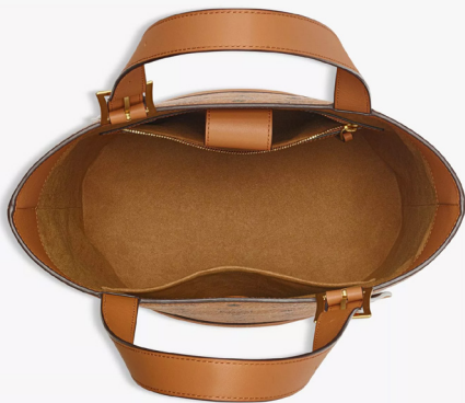
AREN BUCKET TOTE IN VISETOS (MEDIUM)