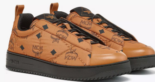
NEO TERRAIN LO SNEAKERS IN QUILTED MONOGRAM NYLON SIZE : 41,42,43 THB 21,300 / NOW THB 12,780