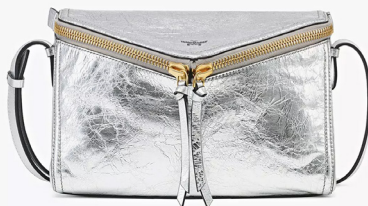
DIAMANT 3D SHOULDER BAG IN METALLIC CALF LEATHER (SMALL) THB 50,100 / NOW THB 35,070