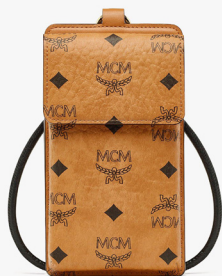
LANYARD PHONE CASE IN VISETOS