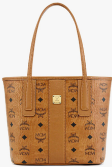
REVERSIBLE LIZ SHOPPER IN VISETOS (MINI)