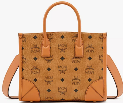
MÜNCHEN TOTE IN VISETOS (SMALL)