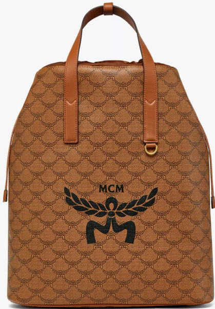
HIMMEL DRAWSTRING BACKPACK IN LAURETOS