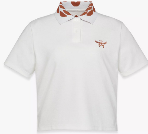
INTARSIA LAUREL PIQUÉ POLO