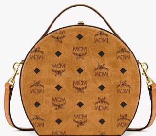
HAT BOX IN VISETOS (MINI)