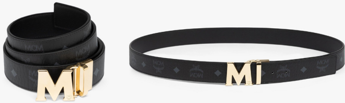
CLAUS M REVERSIBLE BELT IN VISETOS