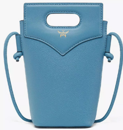
DIAMOND CROSSBODY POUCH IN EMBOSSSED LEATHER AND CALFSKIN