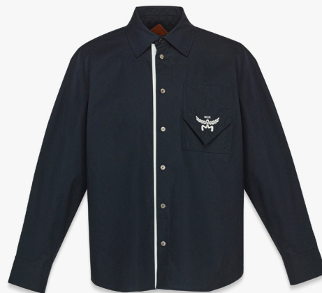
LAUREL POPLIN SHIRT SIZE : 46,49,50,52 THB 15,600 / NOW THB 9,360