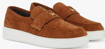
NEO TERRAIN DRIVING SHOES IN CALF SUEDE SIZE : 41,42,43 THB 22,200 / NOW THB 13,320