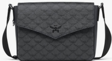
HIMMEL MESSENGER BAG IN LAURETOS (SMALL)