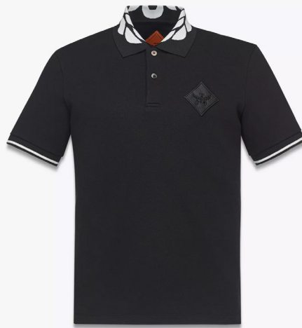
INTARSIA LAUREL PIQUÉ POLO