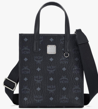
AREN TOTE IN VISETOS (MINI)