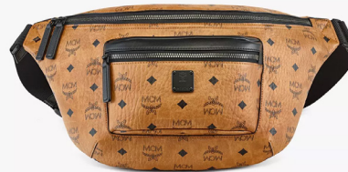
FURSTEN BELT BAG IN VISETOS (LARGE)