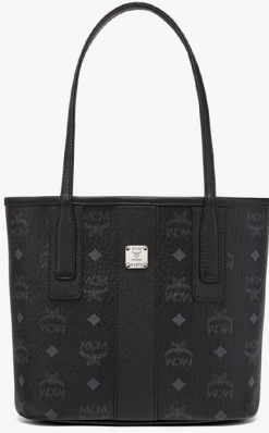
REVERSIBLE LIZ SHOPPER IN VISETOS (MINI) THB 23,000 / NOW THB 18,400