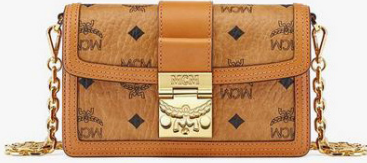
TRACY CROSSBODY IN VISETOS (MINI)