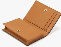
TRACY CARD HOLDER IN VISETOS