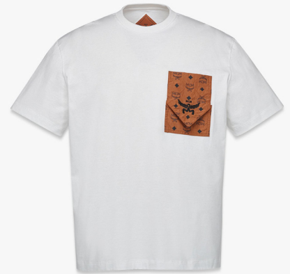
LARGE MONOGRAM PATCH POCKET T-SHIRT