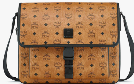
KLASSIK MESSENGER IN VISETOS (MEDIUM)