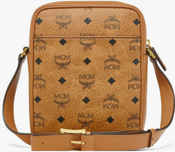
KLASSIK CROSSBODY IN VISETOS