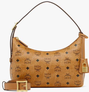
AREN HOBO IN VISETOS (SMALL) THB 29,700