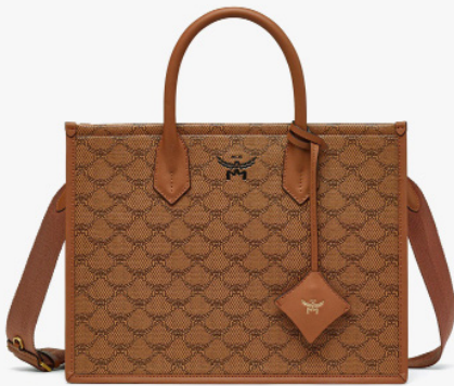
HIMMEL TOTE IN LAURETOS (MEDIUM)