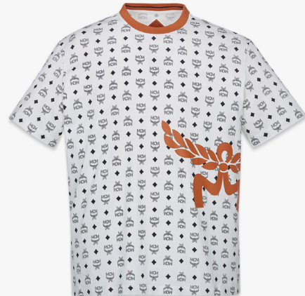
MEGA LAUREL MONOGRAM PRINT T-SHIRT IN ORGANIC COTTON SIZE : S,M,L,XL THB 11,500