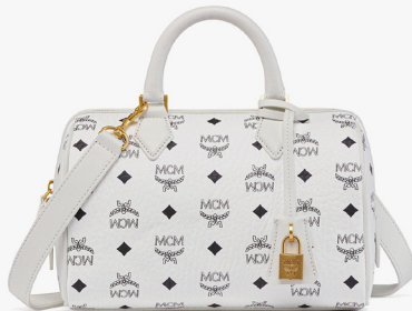
ELLA BOSTON BAG IN VISETOS (SMALL) THB 29,600