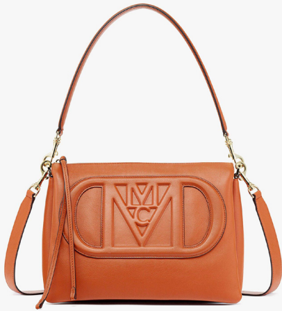
MODE TRAVIA SHOULDER BAG IN SPANISH CALF LEATHER (MEDIUM) THB 53,900