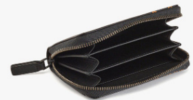
ZIP AROUND WALLET IN MAXI VISETOS