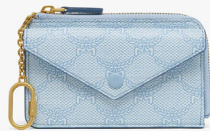
HIMMEL ZIP-AROUND CARD CASE IN LAURETOS