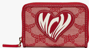
ZIP-AROUND WALLET IN LAURETOS JACQUARD THB 12,100