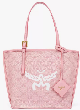
HIMMEL SHOPPER IN LAURETOS (MINI) THB 22,500