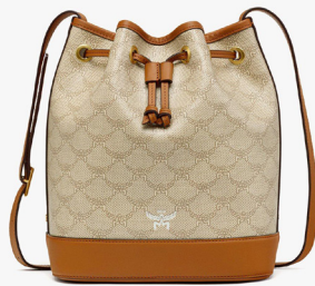
HIMMEL DRAWSTRING BAG IN LAURETOS