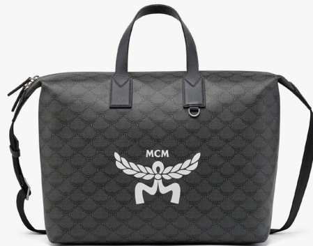
HIMMEL E/W TOTE IN LAURETOS