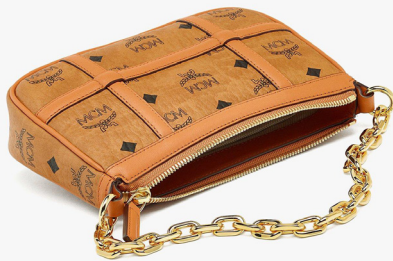
DELMY SHOULDER BAG IN VISETOS