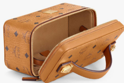
ROCKSTAR VANITY CASE IN VISETOS