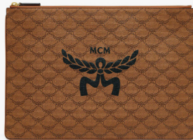
HIMMEL ZIP POUCH IN LAURETOS