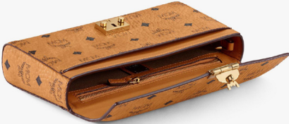
TRACY CROSSBODY IN VISETOS