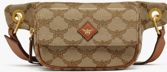
HIMMEL BELT BAG IN LAURETOS JACQUARD