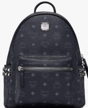
STARK BACKPACK (SMALL 32 CM.)