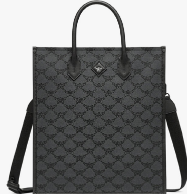
HIMMEL TOTE IN LAURETOS JACQUARD