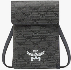
HIMMEL CROSSBODY POUCH IN LAURETOS