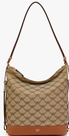
HIMMEL HOBO IN LAURETOS JACQUARD