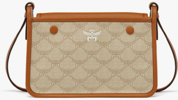
HIMMEL CROSSBODY IN LAURETOS