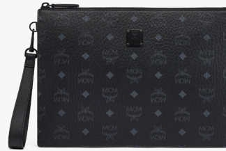
AREN WRISTLET ZIP POUCH IN VISETOS