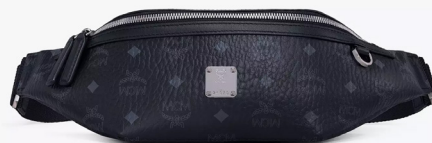
FURSTEN BELT BAG (MEDIUM)