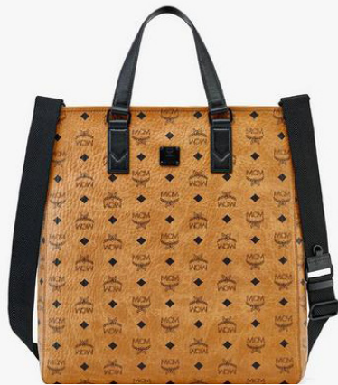
AREN TOTE IN VISETOS