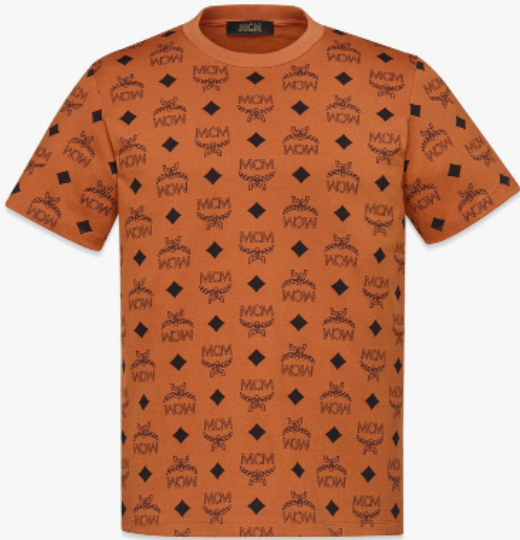
MAXI MONOGRAM PRINT T-SHIRT IN ORGANIC COTTON SIZE : S,M,L,XL THB 11,500