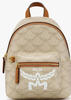
STARK BEBE BOO BACKPACK IN LAURETOS