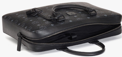
KLASSIK BRIEFCASE IN VISETOS (LARGE) THB 32,700