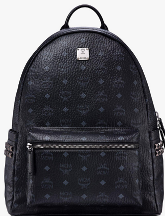
STARK BACKPACK (MEDIUM 41 CM.)