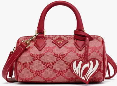
ELLA BOSTON BAG IN LAURETOS JACQUARD (MINI) THB 28,900