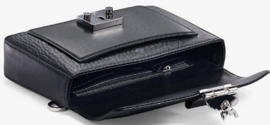
VIKTOR CROSSBODY IN VISETOS (SMALL) THB 29,100