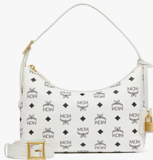
AREN HOBO IN VISETOS (SMALL) THB 29,700