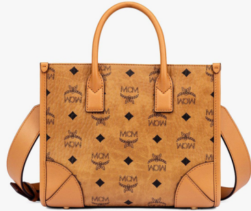
SMALL MÜNCHEN TOTE IN VISETOS