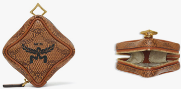
HIMMEL ZIP POUCH CHARM IN LAURETOS