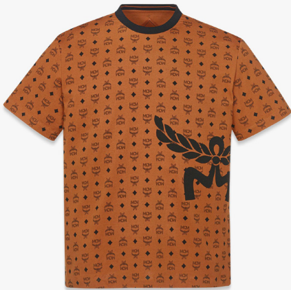
MEGA LAUREL MONOGRAM PRINT T-SHIRT IN ORGANIC COTTON SIZE : S,M,L,XL THB 11,500