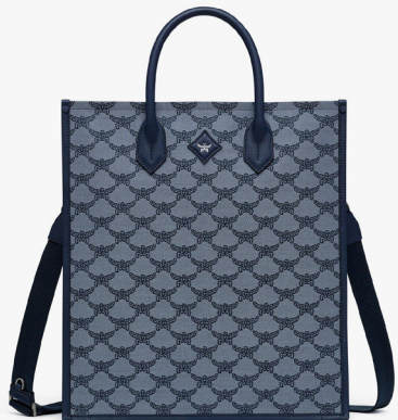
HIMMEL TOTE IN LAURETOS JACQUARD