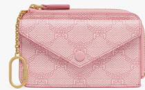
HIMMEL ZIP-AROUND CARD CASE IN LAURETOS