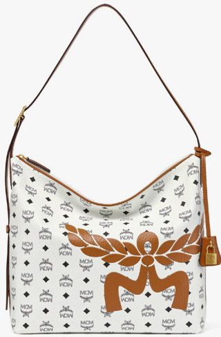
AREN HOBO IN MEGA LAUREL VISETOS (LARGE)