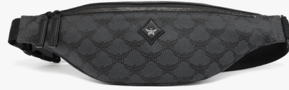
HIMMEL BELT BAG IN LAURETOS JACQUARD