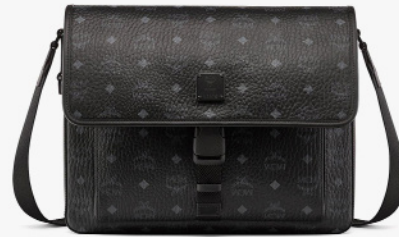
KLASSIK MESSENGER IN VISETOS (SMALL)