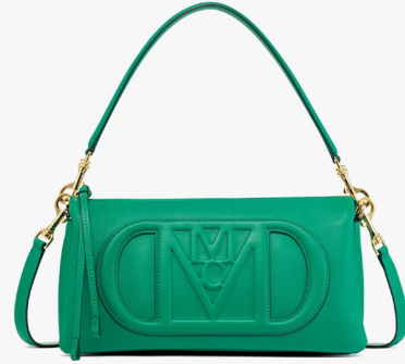
MODE TRAVIA SHOULDER BAG IN SPANISH CALF LEATHER (SMALL) THB 46,300