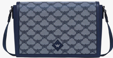
HIMMEL MESSENGER IN LAURETOS JACQUARD