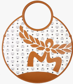
AREN TOTE IN MEGA LAUREL VISETOS