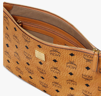
WRISTLET ZIP POUCH IN VISETOS ORIGINAL IN VISETOS THB 15,700