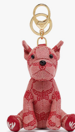
HIMMEL FRENCH BULLDOG CHARM IN LAURETOS JACQUARD THB 10,900