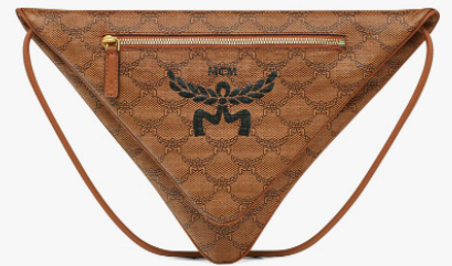
HIMMEL TRIANGLE POUCH IN LAURETOS