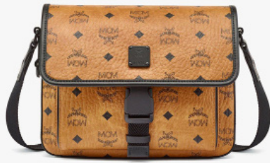
KLASSIK MESSENGER IN VISETOS (SMALL)