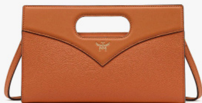
MINI DIAMOND TOTE IN EMBOSSED LEATHER