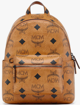
STARK BACKPACK IN MAXI VISETOS (SMALL)