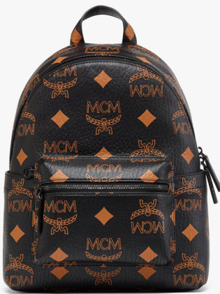
STARK BACKPACK IN MAXI VISETOS (SMALL)