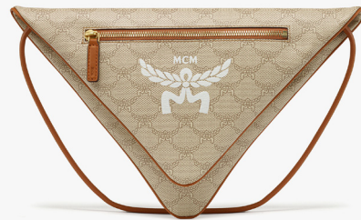
HIMMEL TRIANGLE POUCH IN LAURETOS