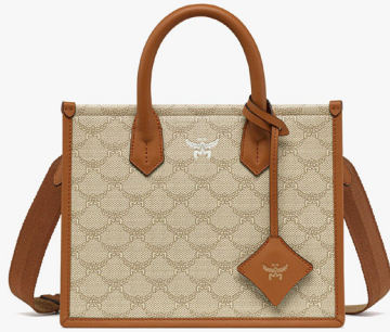
HIMMEL TOTE IN LAURETOS (SMALL) THB 26,600