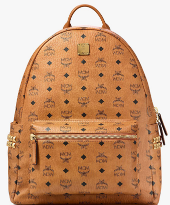
STARK BACKPACK (MEDIUM : 41 CM.)