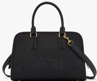
AREN BOSTON BAG IN SPANISH LEATHER (MEDIUM) THB 37,600