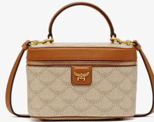
HIMMEL VANITY CASE IN LAURETOS