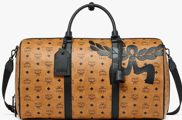
OTTOMAR WEEKENDER BAG IN MEGA LAUREL VISETOS (LARGE) THB 56,400