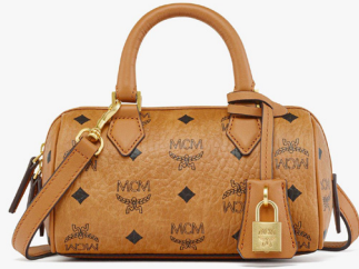
ELLA BOSTON BAG IN VISETOS (MINI) THB 28,900