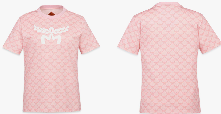
LAURETOS PRINT T-SHIRT IN ORGANIC COTTON