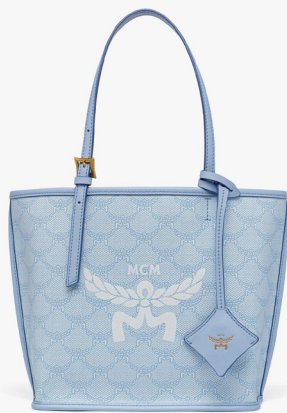
HIMMEL SHOPPER IN LAURETOS (MINI) THB 22,500