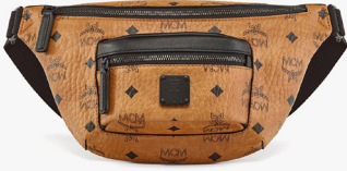
FURSTEN BELT BAG (MINI)