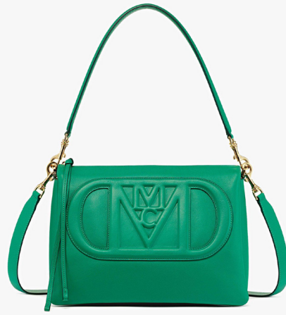
MODE TRAVIA SHOULDER BAG IN SPANISH CALF LEATHER (MEDIUM) THB 53,900