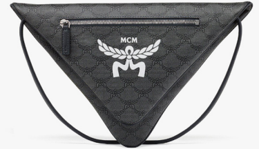
HIMMEL TRIANGLE POUCH IN LAURETOS