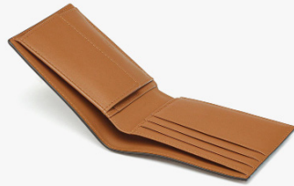
HIMMEL BIFOLD WALLET IN LAURETOS