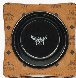
PET BOWL IN VISETOS