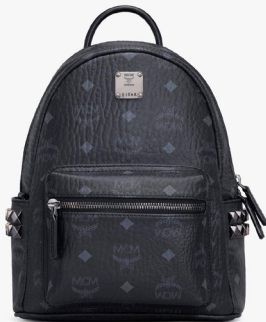
STARK BACKPACK (MINI : 27 CM.)