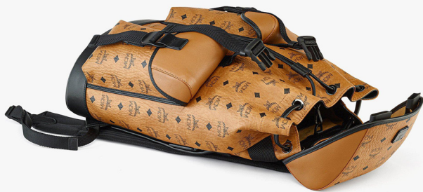
BRANDENBURG BACKPACK IN VISETOS (MEDIUM) THB 48,000