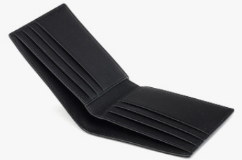
BIFOLD WALLET IN MAXI VISETOS