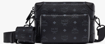
KLASSIK MULTIFUNCTION CROSSBODY IN VISETOS (SMALL) THB 34,100