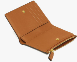
HIMMEL BIFOLD SNAP WALLET IN LAURETOS