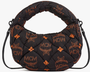
AREN QUILTED HOBO IN MAXI MONOGRAM NYLON