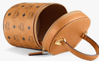
CYLINDER CROSSBODY IN VISETOS