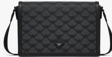
HIMMEL MESSENGER IN LAURETOS JACQUARD