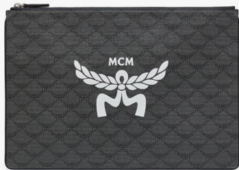
HIMMEL ZIP POUCH IN LAURETOS