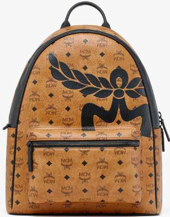
STARK BACKPACK IN MEGA LAUREL VISETOS (MEDIUM) THB 44,400