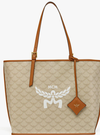
HIMMEL SHOPPER IN LAURETOS (MEDIUM) THB 24,000