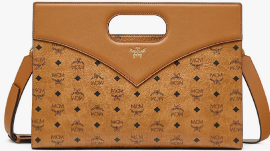
MEDIUM DIAMOND TOTE IN VISETOS LEATHER MIX