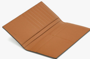
HIMMEL CONTINENTAL WALLET IN LAURETOS