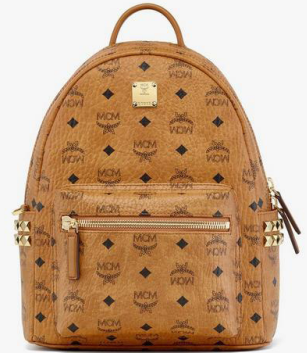
STARK BACKPACK (SMALL 32 CM.)