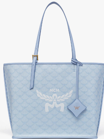
HIMMEL SHOPPER IN LAURETOS (MEDIUM) THB 24,000