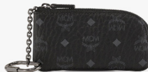
AREN KEY POUCH IN VISETOS