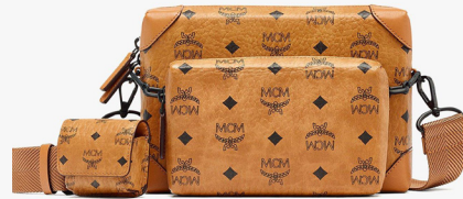
KLASSIK MULTIFUNCTION CROSSBODY IN VISETOS (SMALL) THB 34,100