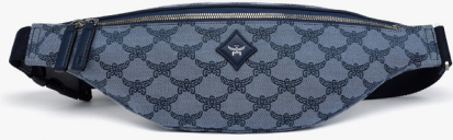
HIMMEL BELT BAG IN LAURETOS JACQUARD