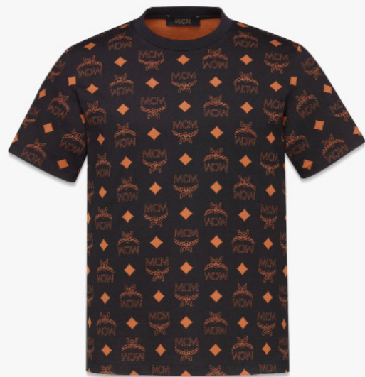
MAXI MONOGRAM PRINT T-SHIRT IN ORGANIC COTTON SIZE : S,M,L THB 11,500