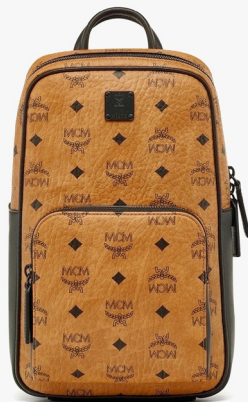
AREN SLING BAG IN VISETOS