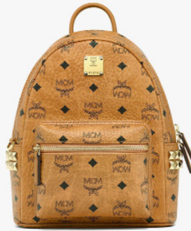
STARK BACKPACK (MINI : 27 CM.)