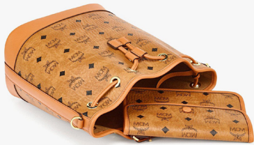
DESSAU DRAWSTRING BAG IN VISETOS (MEDIUM) THB 35,400