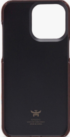
IPHONE 15 PRO MAX CASE IN MAXI VISETOS