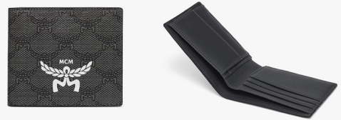
HIMMEL BIFOLD WALLET IN LAURETOS