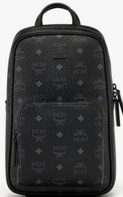
AREN SLING BAG IN VISETOS