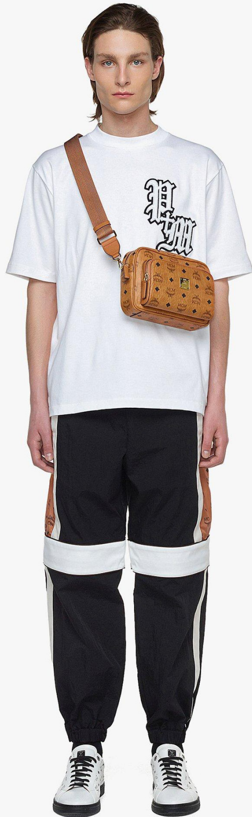
AREN CROSSBODY IN VISETOS (SMALL) THB 27,700