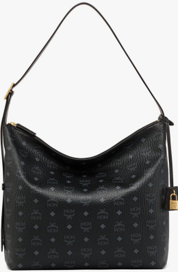
AREN HOBO IN VISETOS