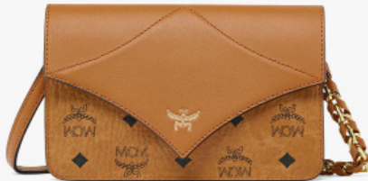
MINI DIAMOND SHOULDER BAG IN VISETOS LEATHER MIX