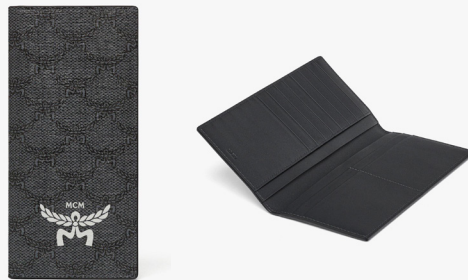
HIMMEL CONTINENTAL WALLET IN LAURETOS