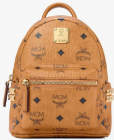
STARK BACKPACK (X-MINI : 20 CM.)