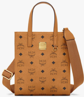
AREN TOTE IN VISETOS (MINI)