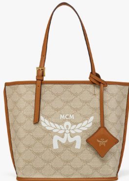
HIMMEL SHOPPER IN LAURETOS (MINI) THB 22,500