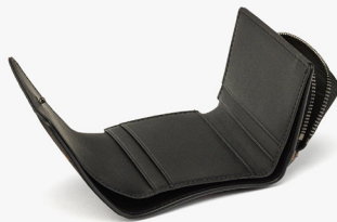
TRIFOLD WALLET IN MAXI VISETOS