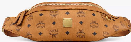
FURSTEN BELT BAG (MEDIUM)