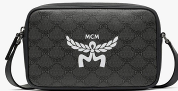
HIMMEL CROSSBODY IN LAURETOS