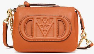
MODE TRAVIA SHOULDER BAG IN SPANISH CALF LEATHER