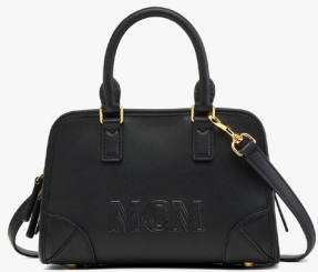
AREN BOSTON BAG IN SPANISH LEATHER (MINI) THB 32,700