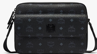
AREN MESSENGER BAG IN VISETOS (MEDIUM) THB 33,600