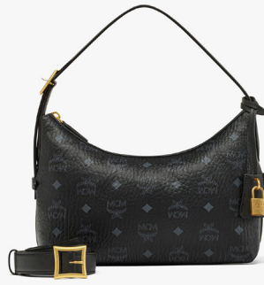
AREN HOBO IN VISETOS (SMALL) THB 29,700