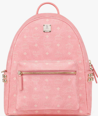
STARK BACKPACK (SMALL-MEDIUM : 38 CM.)