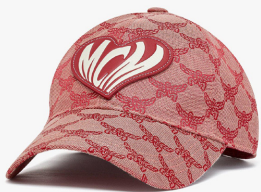
HEART LOGO CAP IN LAURETOS JACQUARD