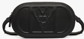
MODE TRAVIA CROSSBODY POUCH IN SPANISH NAPPA LEATHER