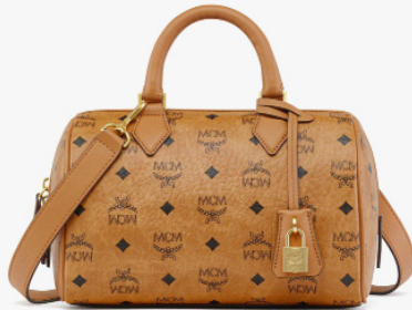
ELLA BOSTON BAG IN VISETOS (SMALL) THB 29,600