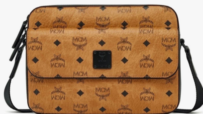
AREN MESSENGER BAG IN VISETOS (MEDIUM) THB 33,600