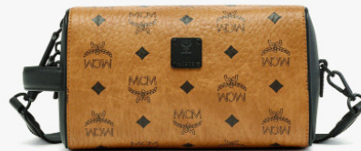
OTTOMAR TOILETRY BAG IN VISETOS