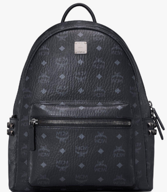
STARK BACKPACK (SMALL-MEDIUM : 38 CM.)