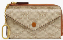
HIMMEL ZIP-AROUND CARD CASE IN LAURETOS