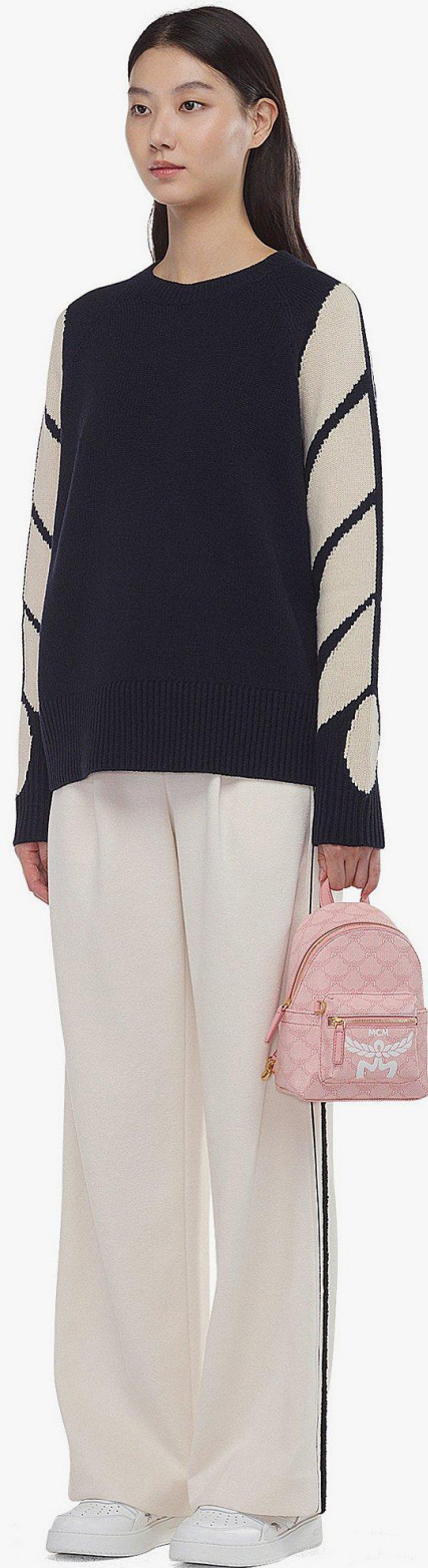
STARK BEBE BOO BACKPACK IN LAURETOS