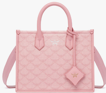
HIMMEL TOTE IN LAURETOS (SMALL) THB 26,600