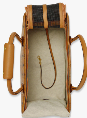
PET CARRIER IN VISETOS