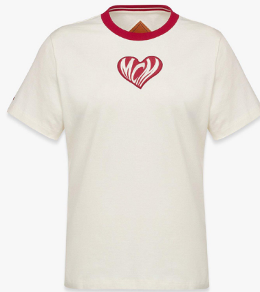
HEART LOGO T-SHIRT IN ORGANIC COTTON