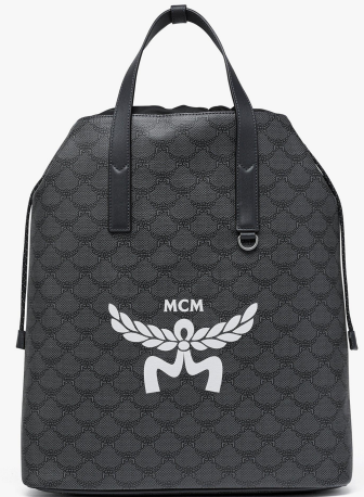
HIMMEL DRAWSTRING BACKPACK IN LAURETOS (MEDIUM)