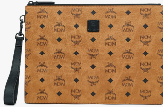
AREN WRISTLET ZIP POUCH IN VISETOS