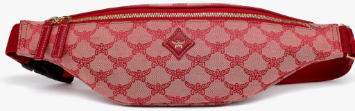
HIMMEL BELT BAG IN LAURETOS JACQUARD THB 24,100