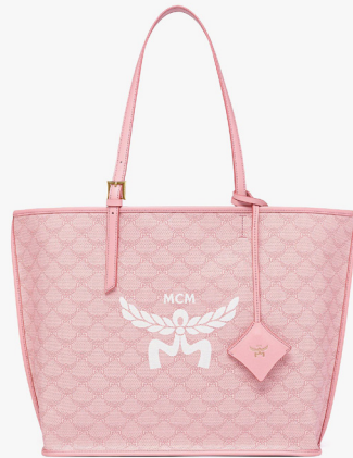
HIMMEL SHOPPER IN LAURETOS (MEDIUM) THB 24,000