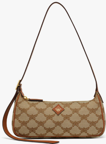
HIMMEL SHOULDER BAG IN LAURETOS JACQUARD