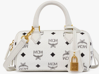
ELLA BOSTON BAG IN VISETOS (MINI) THB 28,900