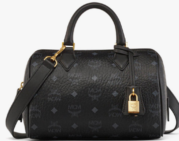
ELLA BOSTON BAG IN VISETOS (SMALL) THB 29,600