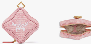
HIMMEL ZIP POUCH CHARM IN LAURETOS