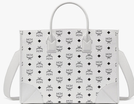
MÜNCHEN TOTE IN VISETOS (LARGE)