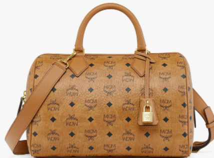
ELLA BOSTON BAG IN VISETOS (MEDIUM) THB 30,000