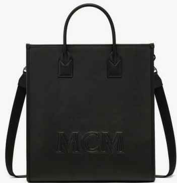
KLASSIK TOTE IN SPANISH CALF LEATHER