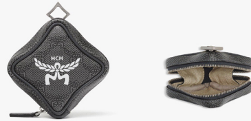
HIMMEL ZIP POUCH CHARM IN LAURETOS