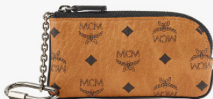
AREN KEY POUCH IN VISETOS