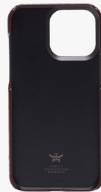
IPHONE 15 PRO MAX CASE IN MAXI VISETOS