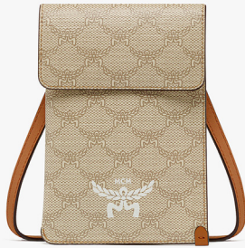
HIMMEL CROSSBODY POUCH IN LAURETOS