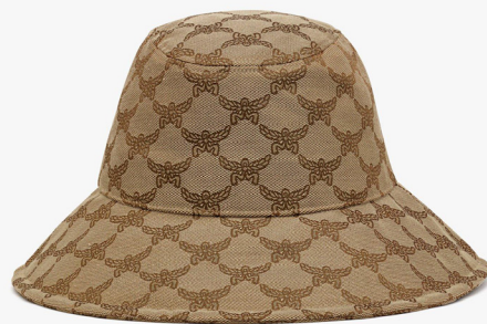
WIDE BUCKET HAT IN LAURETOS DENIM JACQUARD