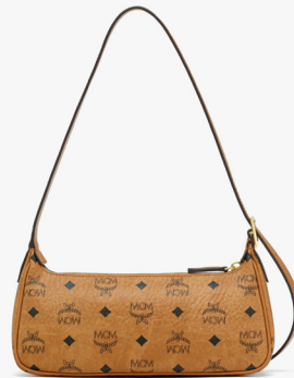
AREN SHOULDER BAG IN VISETOS