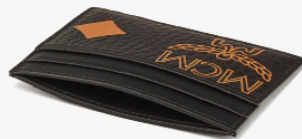
CARD CASE IN MAXI VISETOS