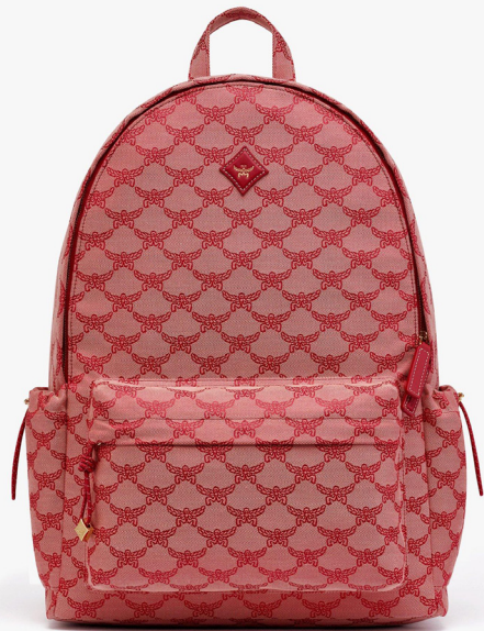
HIMMEL BACKPACK IN LAURETOS JACQUARD THB 38,400