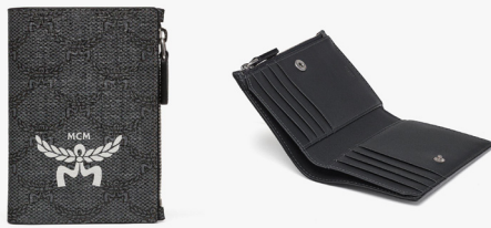
HIMMEL BIFOLD SNAP WALLET IN LAURETOS