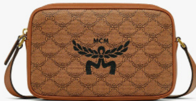
HIMMEL CROSSBODY IN LAURETOS (SMALL)