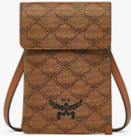
HIMMEL CROSSBODY POUCH IN LAURETOS