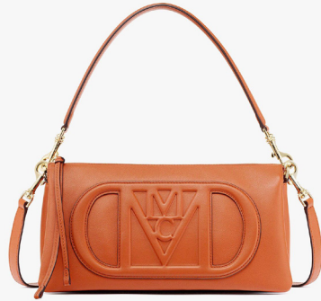
MODE TRAVIA SHOULDER BAG IN SPANISH CALF LEATHER (SMALL) THB 46,300