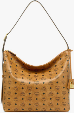
AREN HOBO IN VISETOS