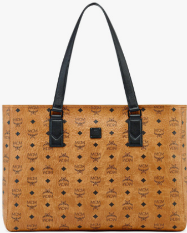
AREN TOTE IN VISETOS