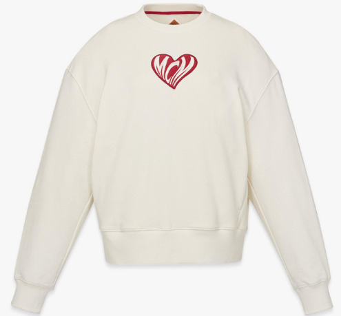
HEART LOGO T-SHIRT IN ORGANIC COTTON