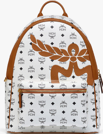
STARK BACKPACK IN MEGA LAUREL VISETOS (MEDIUM) THB 44,400