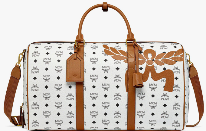
OTTOMAR WEEKENDER BAG IN MEGA LAUREL VISETOS (LARGE) THB 56,400