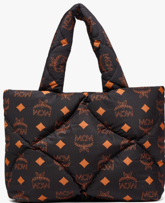
MÜNCHEN QUILTED TOTE IN MAXI MONOGRAM NYLON