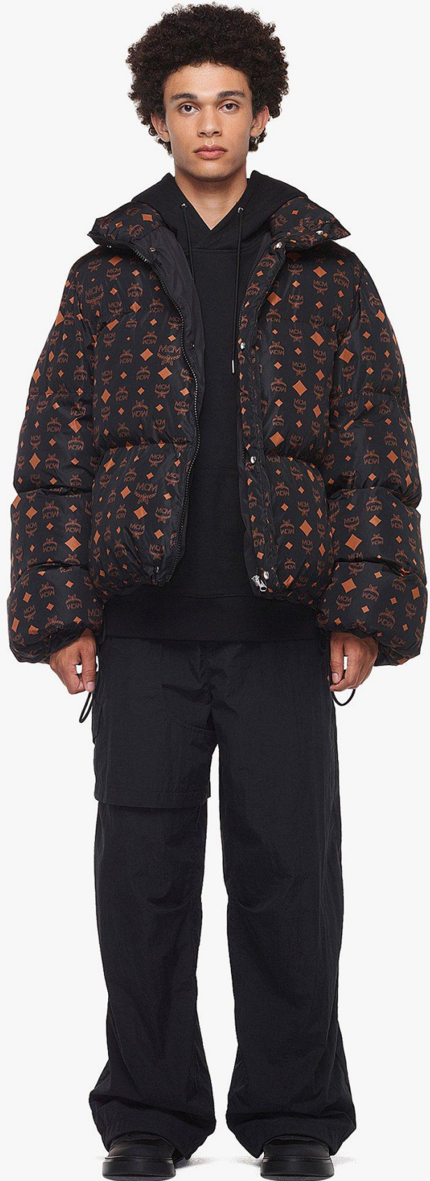
MONOGRAM PRINT PUFFER JACKET IN RE- GENERATED NYLON (SIZE : M,L) THB 50,300