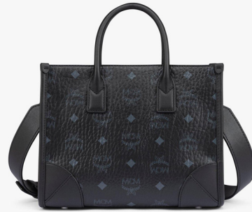
SMALL MÜNCHEN TOTE IN VISETOS