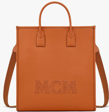
KLASSIK TOTE IN SPANISH CALF LEATHER