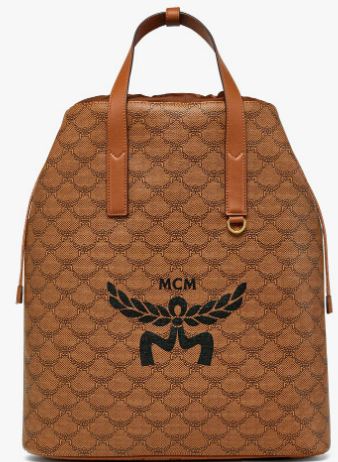
HIMMEL DRAWSTRING BACKPACK IN LAURETOS (MEDIUM)