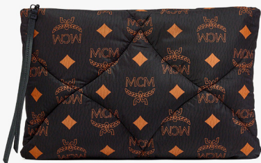
AREN QUILTED POUCH IN MAXI MONOGRAM NYLON