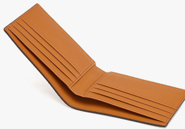
BIFOLD WALLET IN MAXI VISETOS